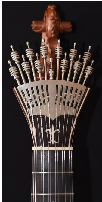
Figure 2 Strings of a Portuguese guitar.

This profession requires effective technical knowledge because it is usual that instruments follow specific rules in terms of dimension and curvature, for example, to obtain the desired sound. This effective technical knowledge is also necessary when we talk about repairing instruments, as it is a very meticulous task.