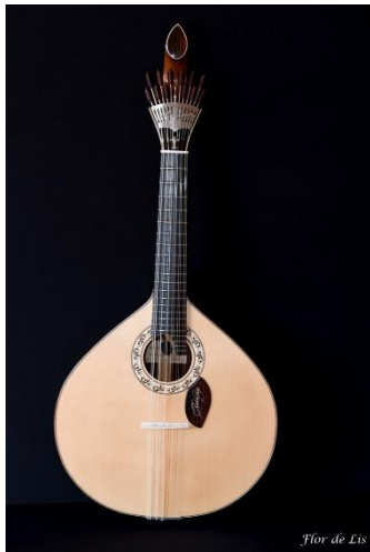
Figure 4 Portuguese guitar made by the interviewed luthier.

Usually, luthiers work in their own workshop or atelier. Although, it is also possible to work in other places as music schools, musical instrument factories and behind the scenes of orchestras, so it is a profession closely related to music and manufacture of instruments.