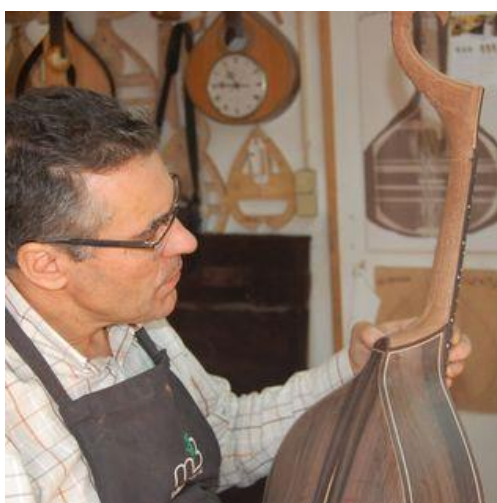
Figure 1 Luthier interviewed making a wooden musical instrument.

Workshop: Luthier (Music instruments with wood)