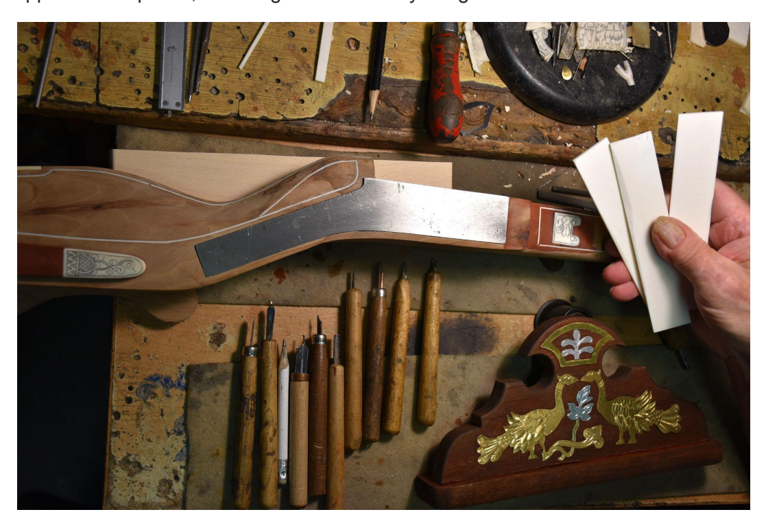
(Tools and materials used in gunsmithing)

Due to the large variety of weapons and their various designs, unusual instruments or tools appear in the plants, including those made by the gunsmith himself.