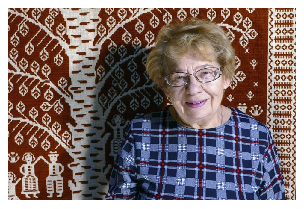
(Chamber of Double Warp Weaving in Janów)

Weaving is one of the oldest crafts cultivated by man, it is a branch of the textile industry and its essence is the production and finishing of fabrics. The double-warp fabric is characteristic of the folk weaving of north-eastern Poland. These are patterned fabrics composed of two interpenetrating layers. They are made with the use of two warps (each in a different color) and two wefts (in the colors of the warps). One side of the fabric is the color opposite of the other. The carpets are woven on 4-harness hand looms in a plain weave. The technique imposes the geometrization of patterns. The oldest we know from Poland are Masurian carpets from the vicinity of Ełk and Olecko, dated at the end of the 18th century. The ability to make carpets was not common. In the second half of the nineteenth and first twentieth centuries, they were made by some small-town craft workshops and a few rural specialists.