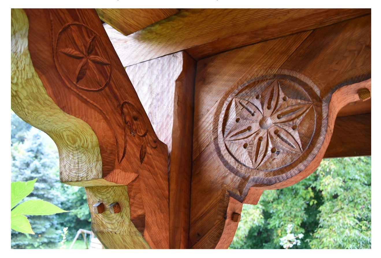
(JanosikArt woodcarving

You can start working with wood already in your adolescence, but it is best to learn the true art of woodcarving under the supervision of experienced educators. This can be done by choosing art or industry schools. There are several centers throughout Poland, including: