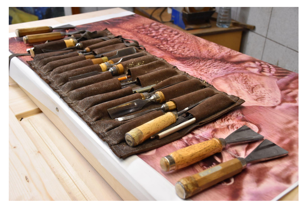
(Chisels used for woodcarving, Photo: Olga Michalska)

Shepherds grinds enough wood and free time, which allowed them to produce decorative items. Juhasi even competed with each other in decorating spoon racks, salt shakers and scoops. Carving often died out with the end of the bachelor status - a mature man did not have time to deal with ornamentation, he did not even have social consent to such activities.